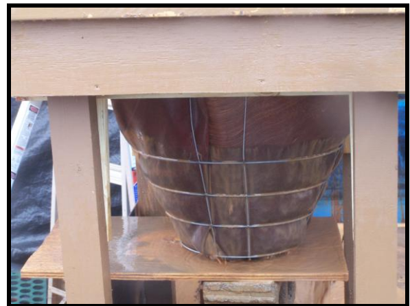
Figure 2. 200 SedCatch® Sediment Basket™ Collecting Sediments in Test