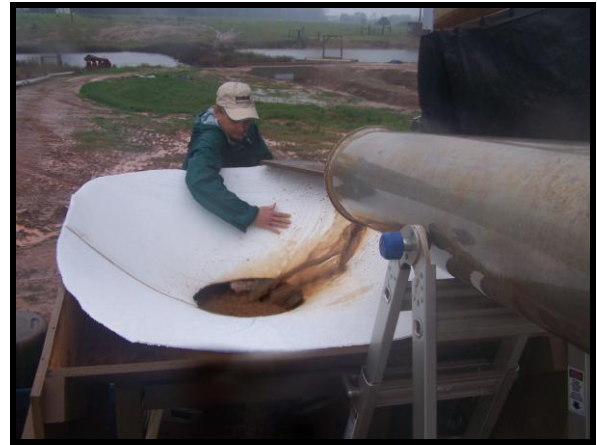
Figure 1. Test set-up, including mixing tank, supply pipe and wooden box with simulated area inlet inside collection tank.